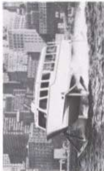
In regular service 1964 New York World's Fair American Hydrofoil Inc. fast boat

Supramar is the leading international organization specializing in the development, design, and licensing of Hydrofoil water transportation. Twenty years of research have gone into the perfection of Supramar products.